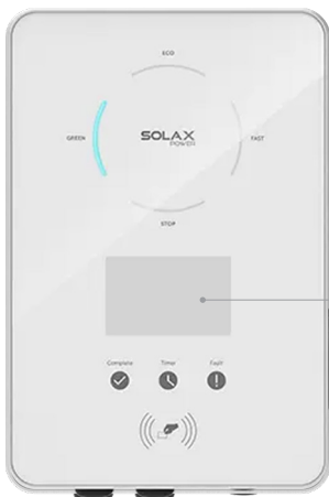
Serie SXC. Potenza disponibile: 22 kW.